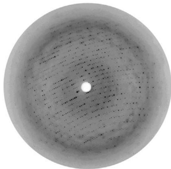
Figure 2 Diffraction pattern of yeast ADH crystals at beamline 17-ID at the Advanced Photon Source.

tion images were recorded at a crystal-to-detector distance of 145 mm with 1^\circ oscillation per image and an exposure time of 20 s per frame on a MAR165 CCD detector. A Zn fluorescence scan was taken from the same crystal using a Bicon Fluorescence Detector, increasing the monochromator energy in small steps. All data were processed using XGEN (Howard, 2000).